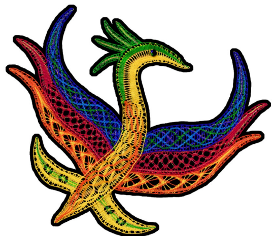
DESIGN & LACE BY LOUISE COLGAN

Instruction will cover all levels of Milanese techniques. Students are given the option of using colored threads to make their own unique pieces from the selected patterns. Anyone new to Milanese as well as those continuing with an existing project are welcome.